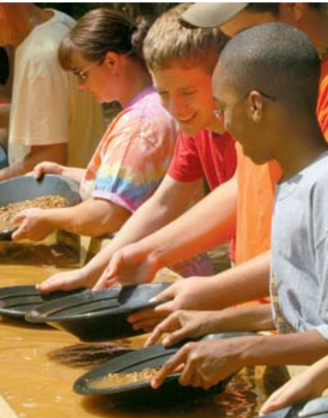
Reed Gold Mine.

Learn how man's alphabets and languages developed and how Wycliffe Bible Translators develop written representations of spoken l