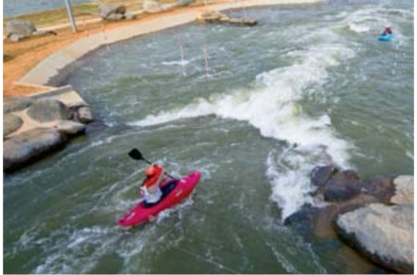
U.S. National Whitewater Center.

President Andrew Jackson, known as "Old Hickory," grew up nearby. 8215 Waxhaw Hwy. (N.C. 75 E.), Waxhaw. 704.843.1832. www.perigee.net/~mwaxhaw .