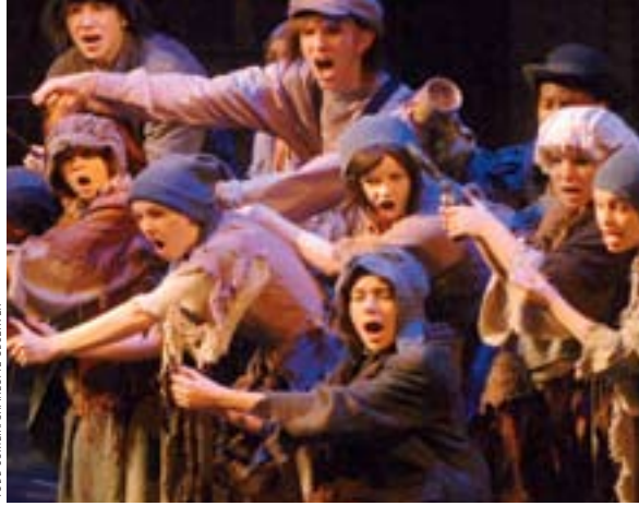
Children's Theatre of Charlotte.

ner theater and children's programs. It is also in the process of building its own theater in Davidson. 704.892.7953. www.davidsoncommunityplayers.org .